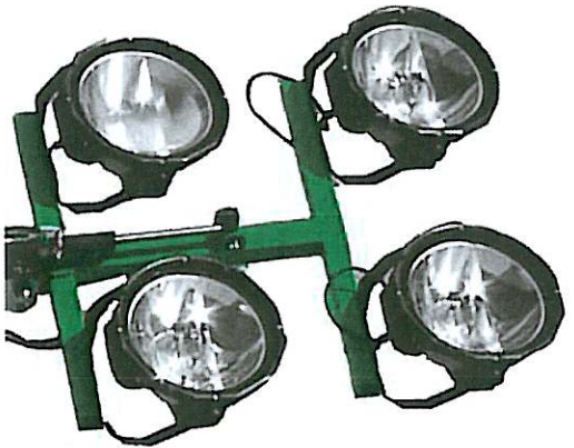
4X2000W metal halide heads